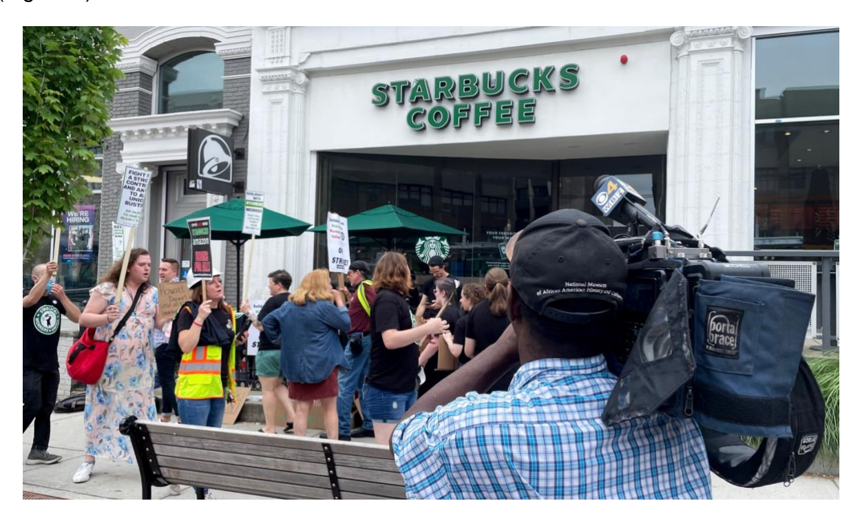
Figure 2: SBWU Boston garnered local news coverage during its indefinite strike on Commonwealth Avenue in Boston, Massachusetts. Organisers relied on their relationships with community activists, politicians, and local unions to staff the picket line. 18 July 2022.